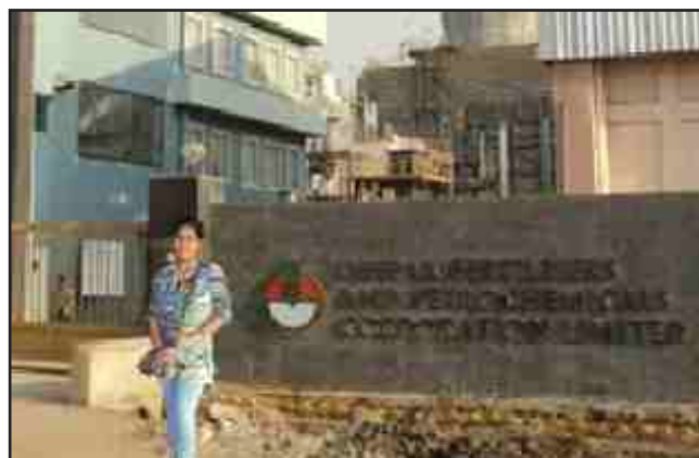
Visited Biomedical waste plant, Kalwa, Nitric Acid Manufacturing Plant of Deepak Fertilizer and Petrochemicals Pvt Ltd