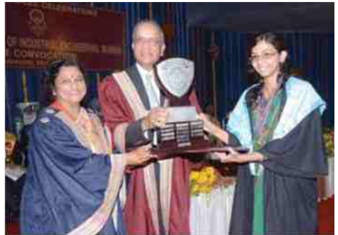
XIX Convocation Ceremony, NITIE June 5, 2013, NITIE Campus, Mumbai