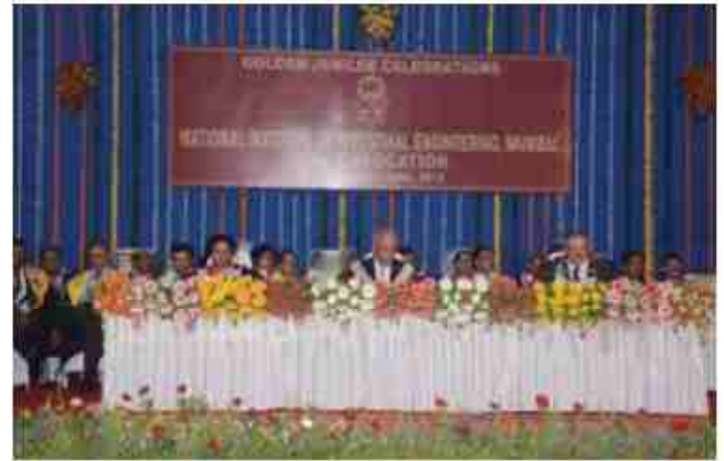
XIX Convocation Ceremony NITIE June 5, 2013 NITIE Campus, Mumbai