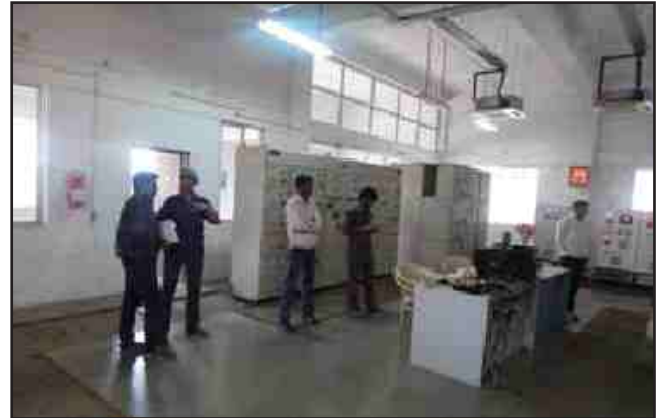
Hydro Electric Project at DHOM, Satara