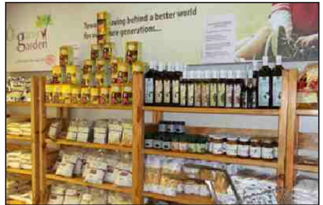
Organic shop at Powai, Hiranandani