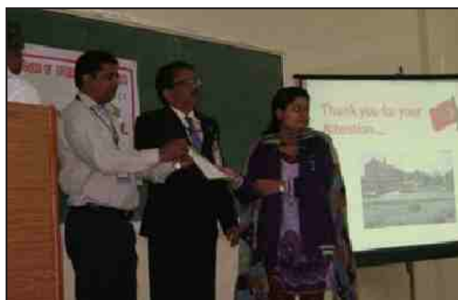
Papers and posters presented at ICER 13, Aurangabad