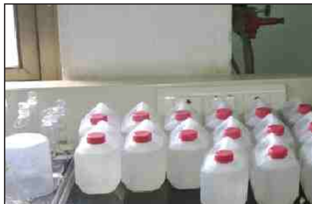
Water sample from Powai lake