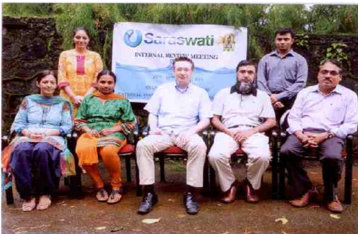
SARASWATI Internal Review Meeting held at NITIE on 17 th & 18 th August 2013

in January, 2013. It is a part of an overall project with 7 Indian and 7 European partners. The project is for a duration of 3 years with budget outlay of Rs.46,32,000/-. All deliverables of the project have been met to date and 5 publications are accepted. Work towards setting up the sludge composting pilot plant is in progress.