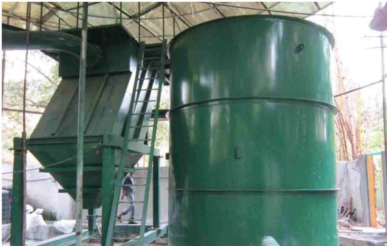
Site selected for pilot study Closed vessel composting unit Location: Nirvana Park, Hiranandani, Powai, Mumbai